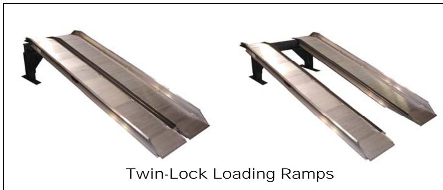
Twin-Lock Loading Ramps

Walk Boards are manufactured for both Regular and Light Duty applications. Capacities range from 600 to 1,500 lbs., overall widths of 26", 30", 34" and 37" with lengths from 4' to 16'.